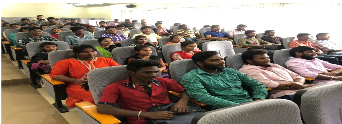
◆ Noise and air pollution workshop